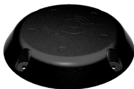
Model # TEKZ-SIG-X 1 -PKSUF