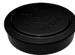
Model # TEKZ-SIG-X 1 -PKFLS